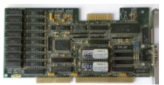
Core: GN007001-B Memory: 512kB Year: 1989 Bus: ISA 16bit